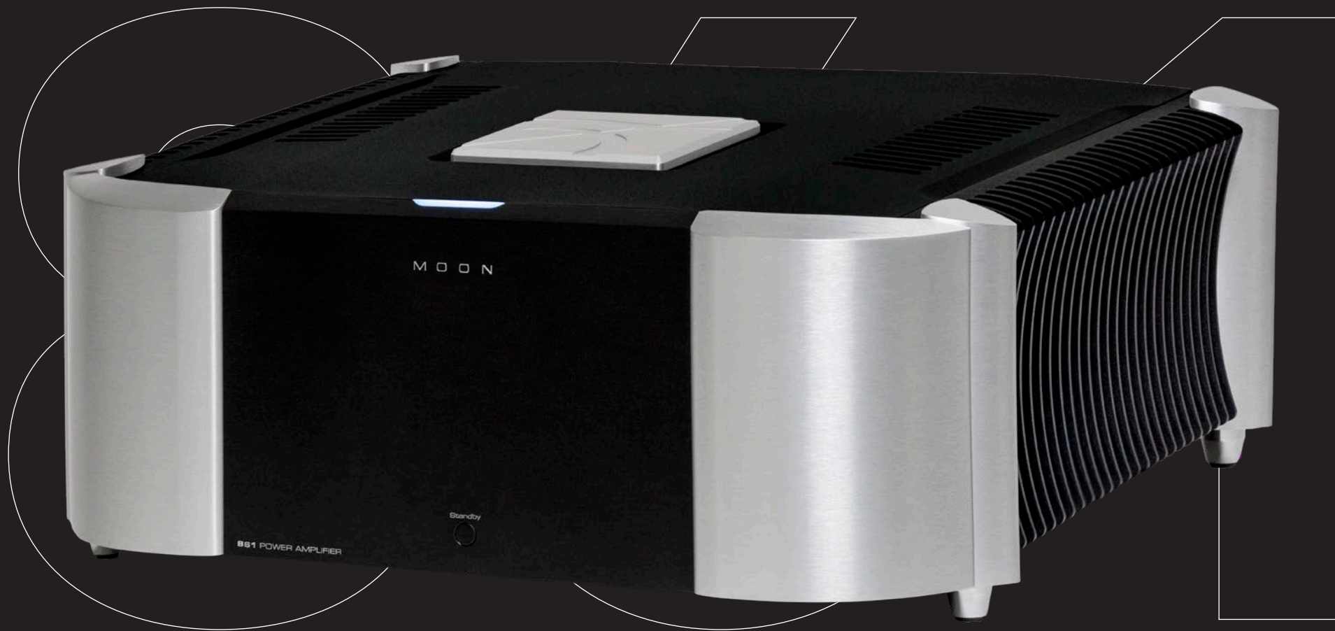
— 861 Power Amplifier —