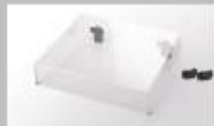
Dust cover DPPD-05C151 Specific to the PD-151 MARK II 4mm thick acrylic, with support fingers

Accessories (available as service parts)