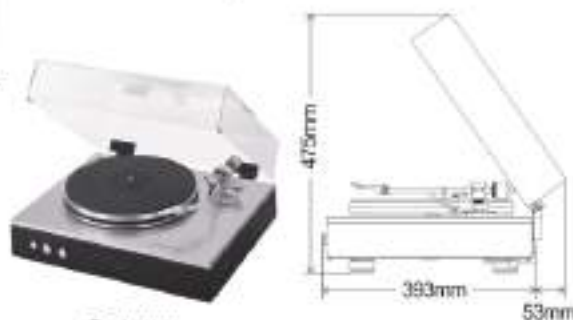
Dust cover (sold separately)