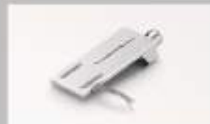
Headshell DPPD-SHG Machined aluminum, 13g (including O.F.C. wires)