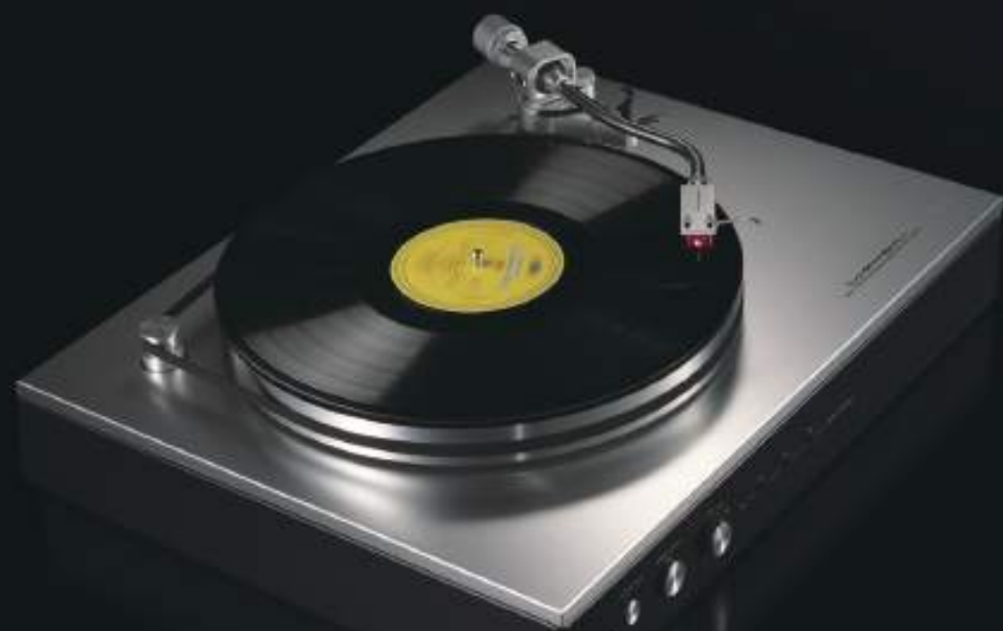
The phono cartridge and analog records are not included.

We deliver genuine analog vinyl playback excellence, inviting the listener into a world different from digital audio.