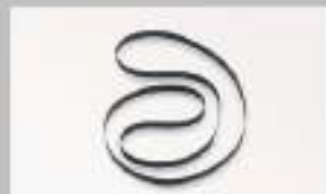
Rubber drive belt