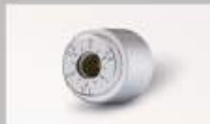
Heavy counterbalance weight DPPD-4W2 For cartridges of 9 to 18g (32 to 33g including headshell)