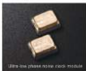
Ultra-low phase noise clock module