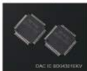
DAC IC BD34301EKV