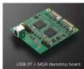
USB I/F + MQA decoding board