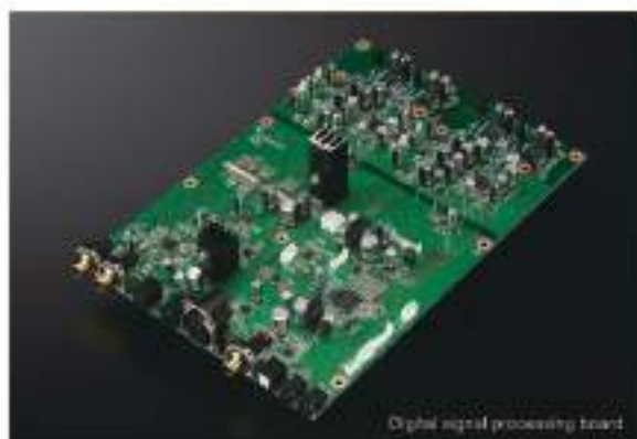
Digital signal processing board