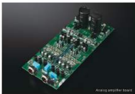
Analog amplifier board

The DA-07X brings together excellent high-end digital circuitry, inherited from our high-performance D-07X SACD/CD player, and an advanced analog output system. LUXMAN's long-standing knowledge gained in amplifier development meets our newest digital technologies in order to realize expressive musicality that makes use of the abundant information contained in digital audio data, supporting the highest specifications of PCM and DSD formats.