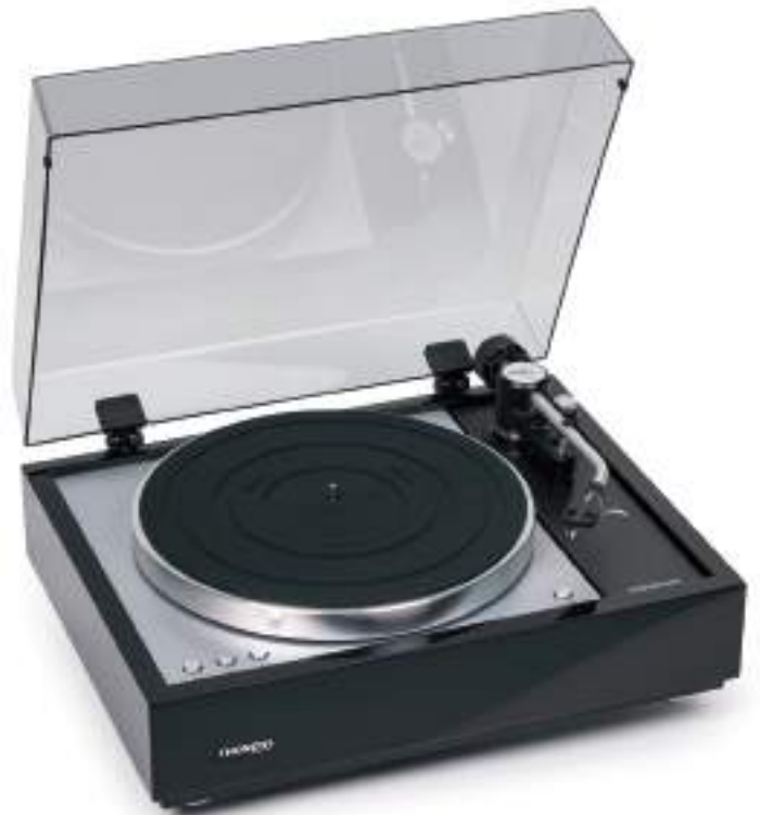
... and today 2020 TD 1600/1601