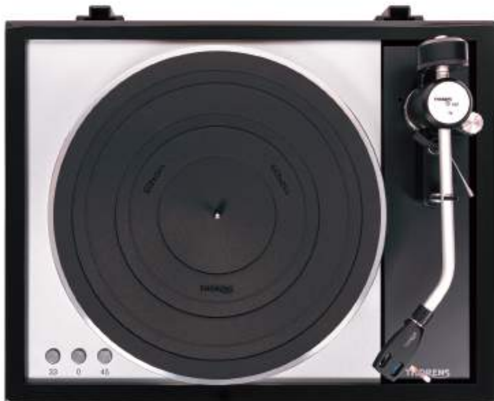
TD 1600 with TP 160 tonarm