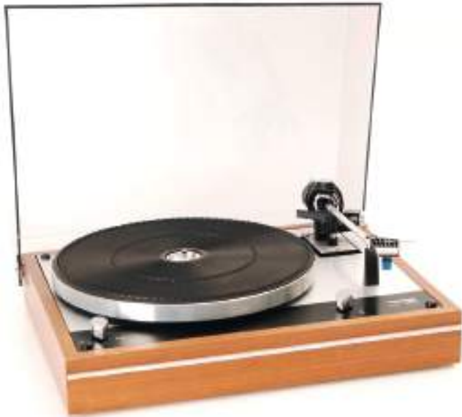
1972 TD160 ...