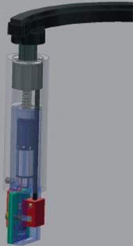
Patented electronic lift for the TD 1601