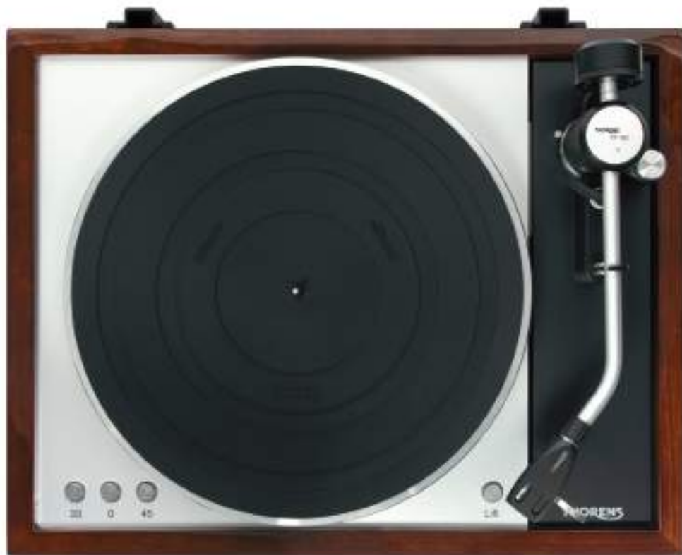
TD 1601 with TP 160 tonarm