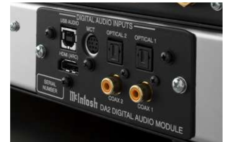
Typical DA2 installed.