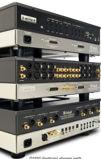
D1100 (bottom) shown with optional C1100. All units sold separately.