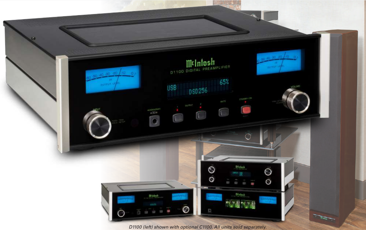
D1100 (left) shown with optional C1100. All units sold separately.